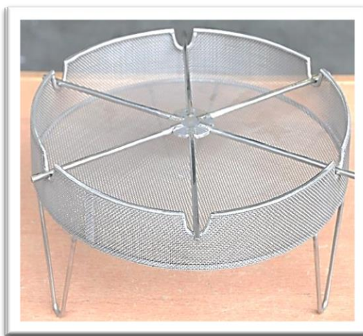
Accessory Holder Tray