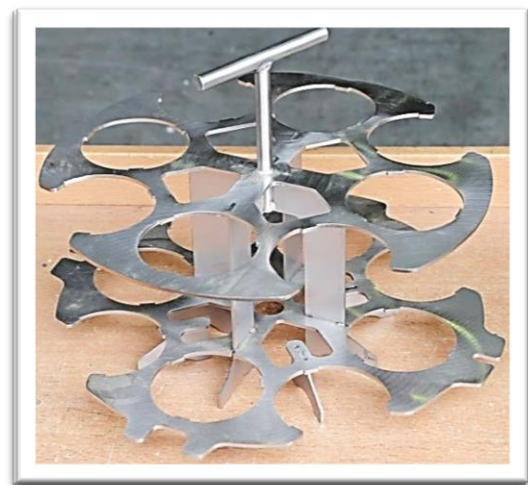
RTFOT Glass Holder Tray